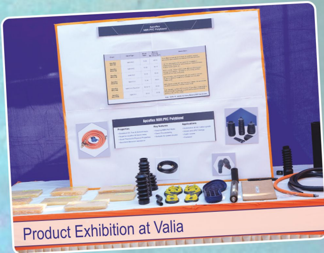
Product Exhibition at Valia