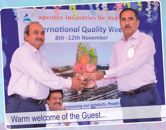
Warm welcome of the Guest...