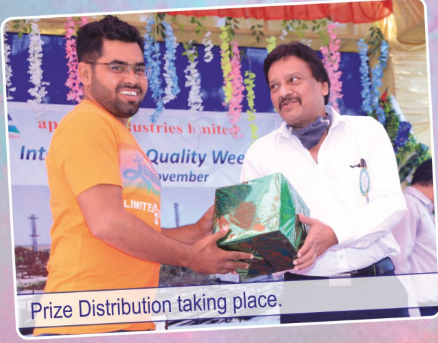
Prize Distribution taking place.