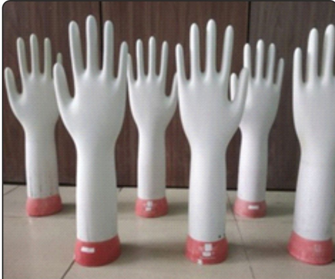
Ceramic moulds used for disposable glove manufacturing

glove manufacturing. Properties such as good chemical, oil and acid resistance, reduced risk of allergy issues compared to Natural Rubber latex