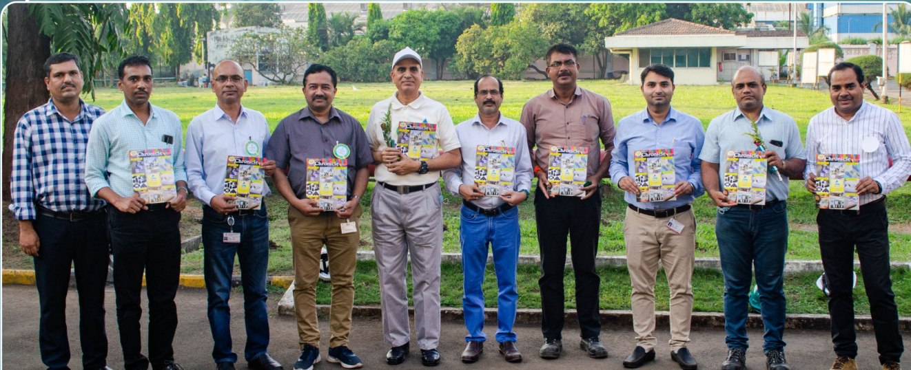
Historical moment: Launching of Apcotex quality in-house magazine "Quality Chronicle"