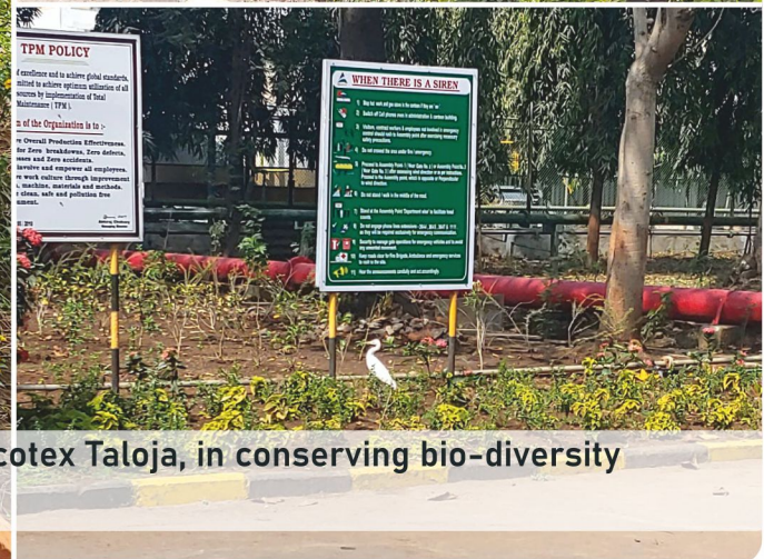
Upcoming results to the efforts taken by Apcotex Taloja, in conserving bio-diversity through maintaining the "Butterfly Garden"!