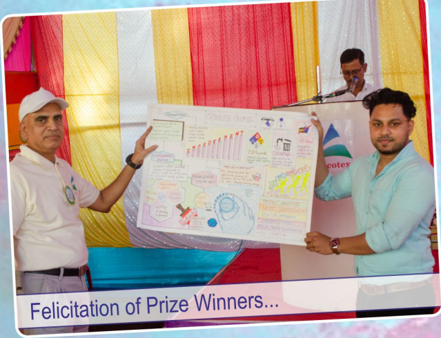
Felicitation of Prize Winners...