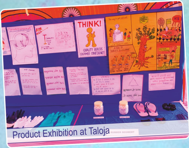
Product Exhibition at Taloja

During the period of celebration, the focus was set on total employee awareness and engagement on different aspects of quality, encouragement and awareness on customer centricity; sustainability and Apcotex Quality system.