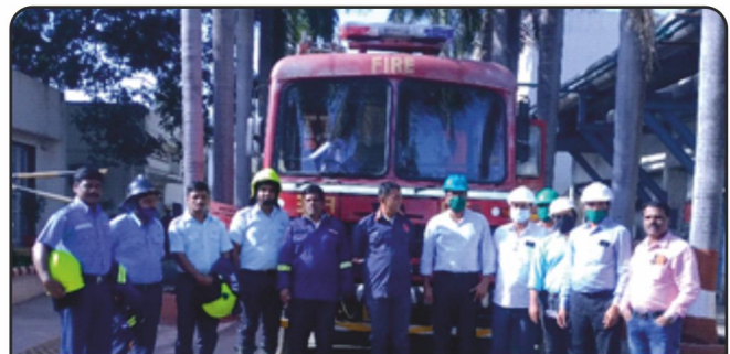
Visit of Fire Officer from Taloja Fire Station for training and information sharing.