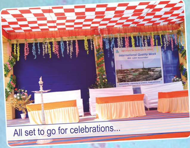
All set to go for celebrations...

During these week-long celebrations, various activities such as; product exhibition, competitions and quizzes were conducted and prizes were also distributed. These programmes has been found helpful in enhancing the employee awareness and engagement on customer centricity and sustainability. Here are some of glimpses of International Quality Week 2021 Celebrations at Valia Plant.