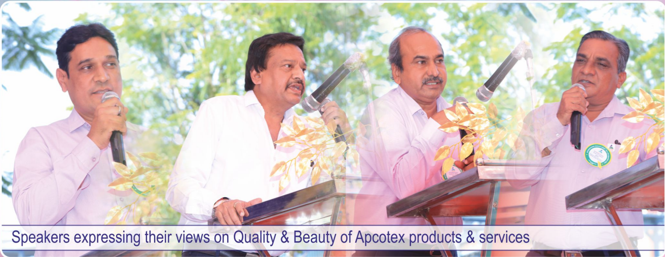
Speakers expressing their views on Quality & Beauty of Apcotex products & services