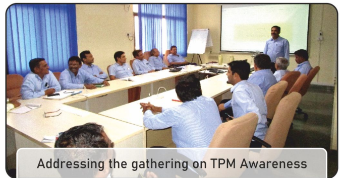
Addressing the gathering on TPM Awareness