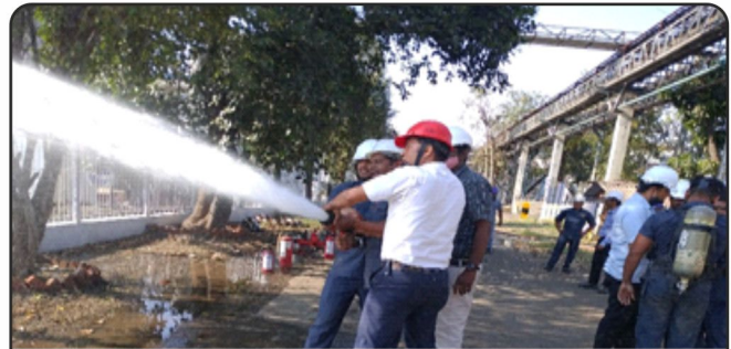
Fire-fighting training to Fire-fighting team of the Taloja plant by Fire Officers from Taloja Fire Station.

Keeping this in mind; on regular intervals, Apcotex is inviting external agencies to improve the knowledge base of its employees related to various aspects of work culture. Presenting herewith few moments of external agencies visit in Apcotex Taloja plant.