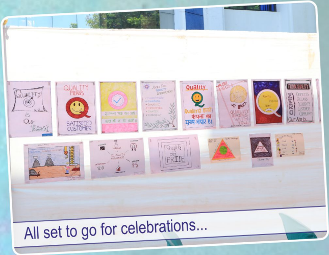
All set to go for celebrations...