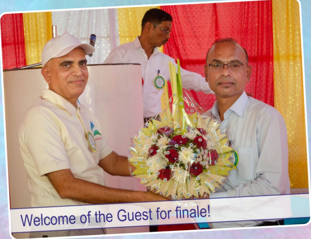
Welcome of the Guest for finale!