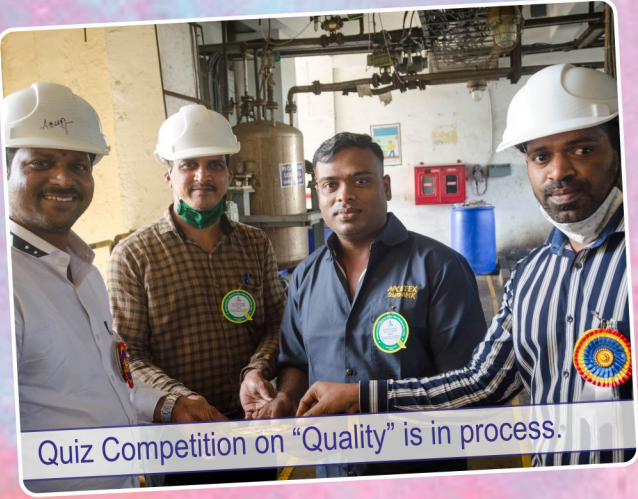
Quiz Competition on "Quality" is in process.