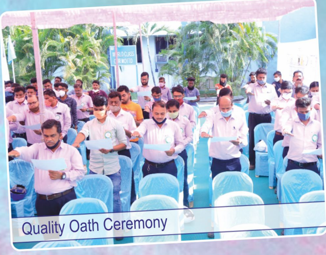
Quality Oath Ceremony