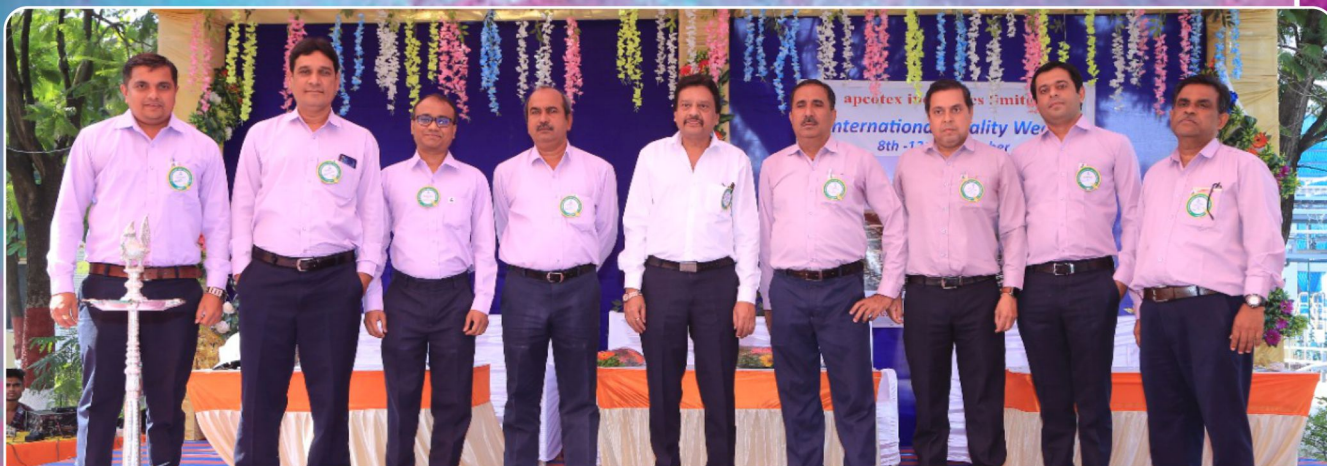
Team Valia: Responsive and proactive in celebrations!