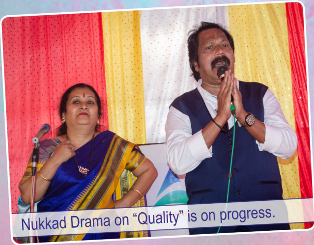
Nukkad Drama on "Quality" is on progress.