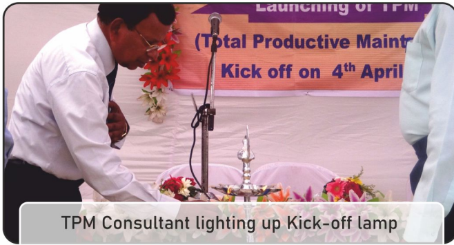
TPM Consultant lighting up Kick-off lamp