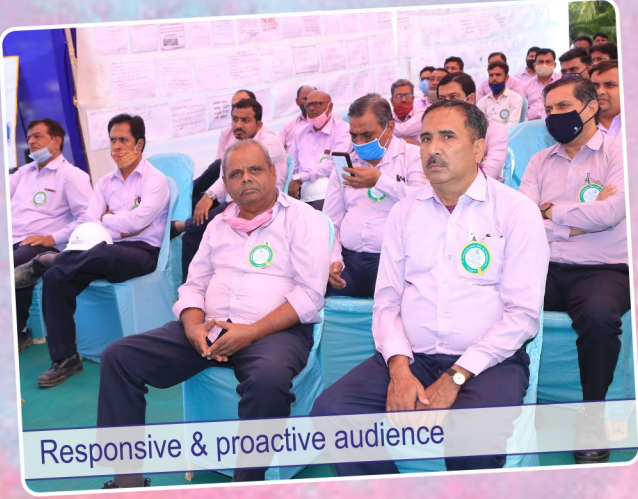
Responsive & proactive audience