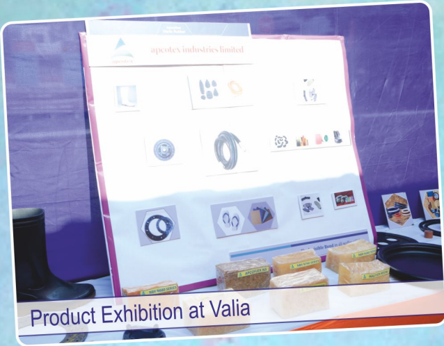
Product Exhibition at Valia

Various events were organized at plant level to encourage the employees engagement in “Quality and Beauty” of Apcotex products and services. This celebration encouraged creative thinking and awareness of employees in various aspects of quality and applying the Quality Management System inside the company as well as their dedication in customer centricity and customer service.