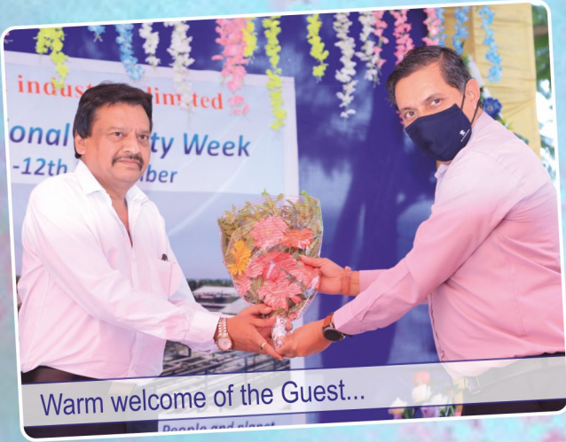
Warm welcome of the Guest...