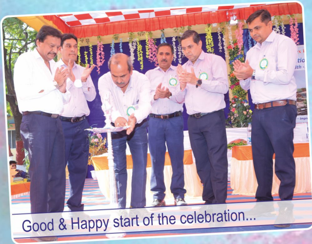
Good & Happy start of the celebration...