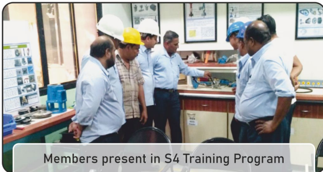
Members present in S4 Training Program