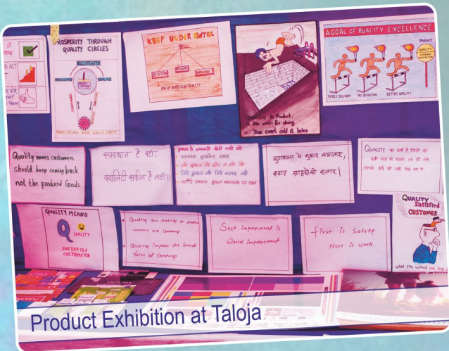
Product Exhibition at Taloja