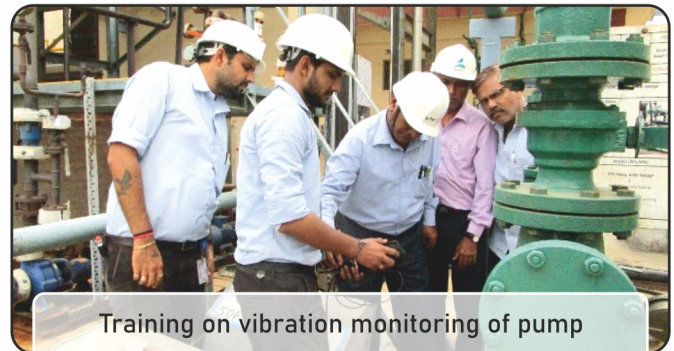
Training on vibration monitoring of pump