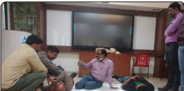
Training to First-Aiders team of plant by Lifeline Institute of First-Aid and Emergency Medicine.