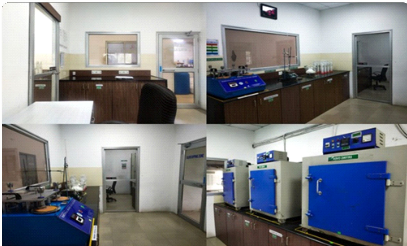
Laboratory for glove compounding, processing and testing at Apcotex

properties to be considered for glove manufacturing. With the spread of COVID-19, the requirements and demand for NBR latex based gloves increased drastically. NBR latex market is divided into food, healthcare and industrial primarily. The industrial end-user category was the second largest segment in overall industry in terms of revenue. In 2020, the NBR latex market captured for more than 80% share for medical