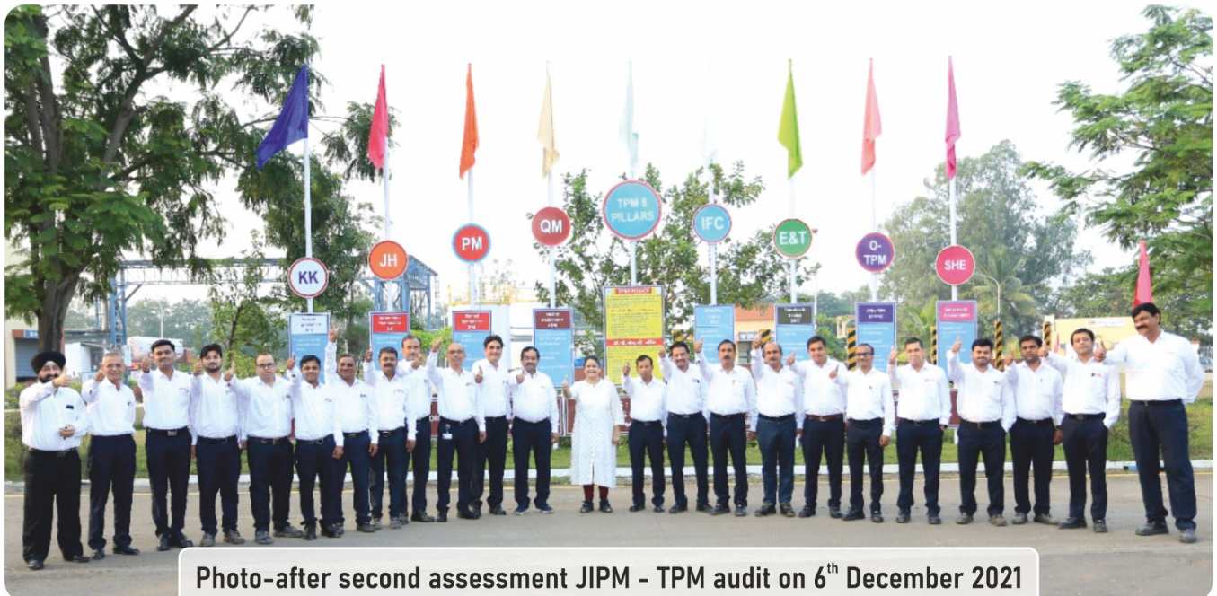
Photo-after second assessment JIPM - TPM audit on 6 th December 2021