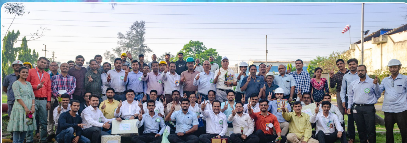
Team Taloja: Limitless enthusiasm in celebrations!