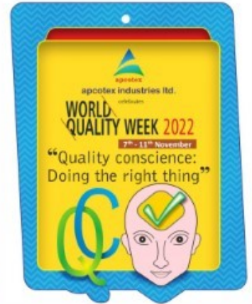
▲ Distribution of Quality week badge.