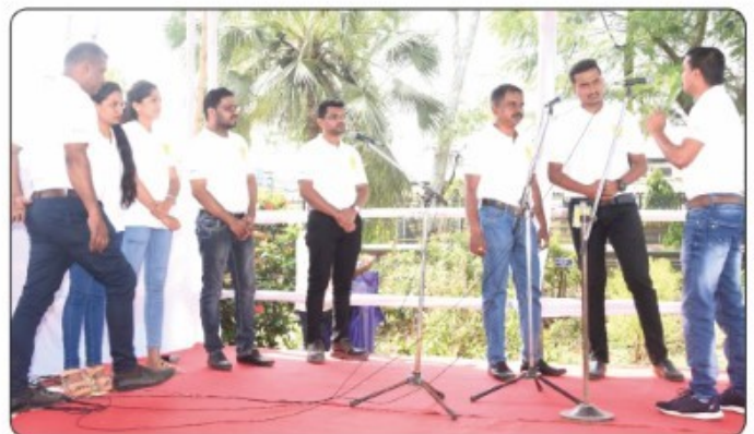
▲ Skit performance: Importance of QHSE.