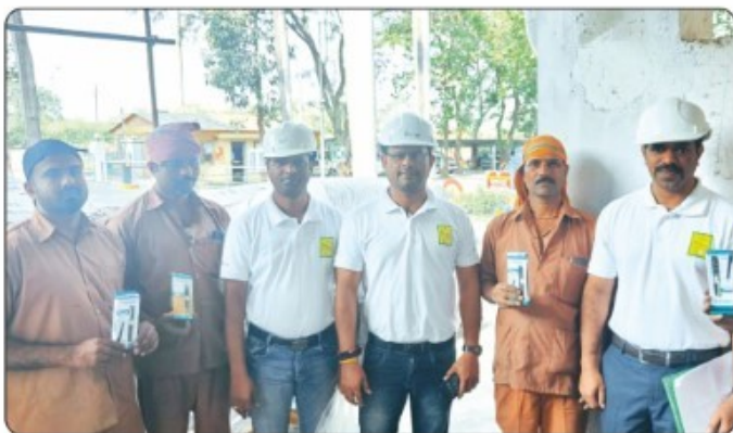
▲ Departmentwise 'Chalta-Bolta' Quiz Competition.