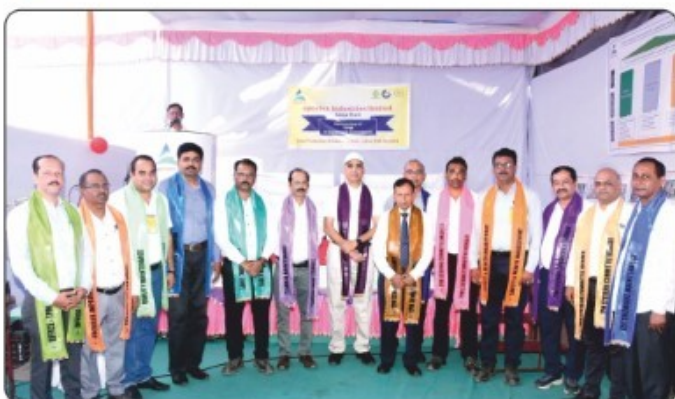
▲ TPM re-launching ceremony.