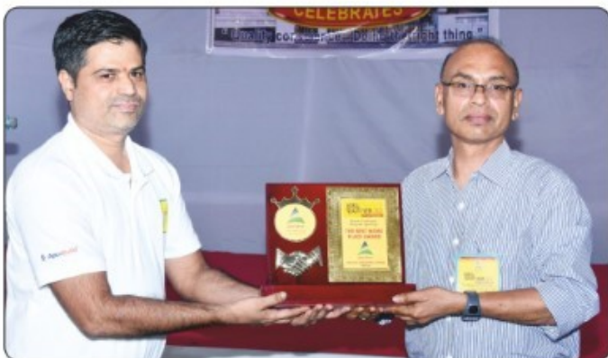
▲ Best Working Place Award: Winner Paper Lab