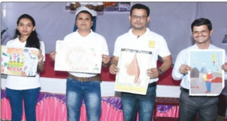
▲ Posters, Slogans and Models submission by employees.