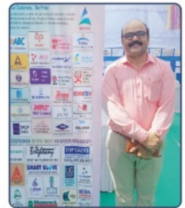
▲ Visit of key customers and vendors for the event.