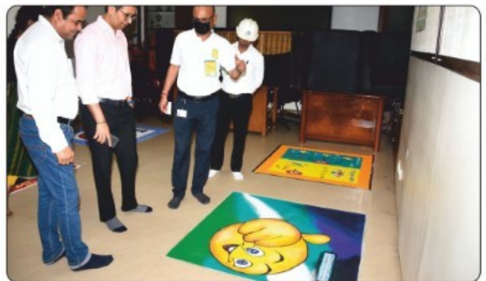
▲ Rangoli Competition.