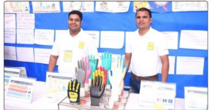
▲ Product display: Gloves Segment