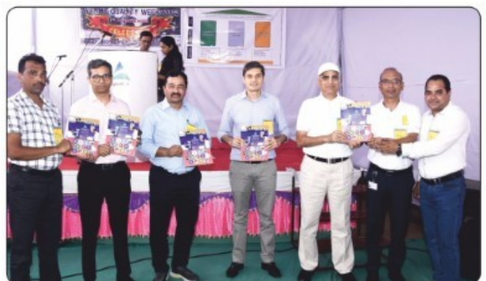
▲ Inauguration of Quality Chronicle magazine.