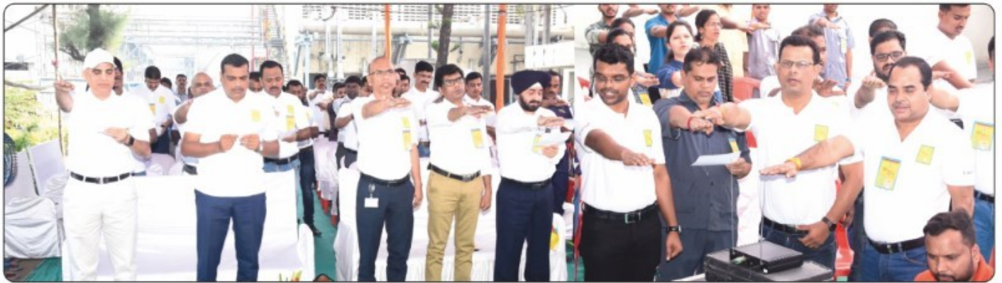
▲ Quality Oath taken by Team Talaja during the opening ceremony.