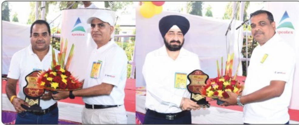
▲ Warm Welcome of honorable guests & committee members.